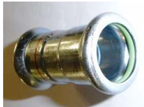
Fig. 2 Fitting before installation (Viton)