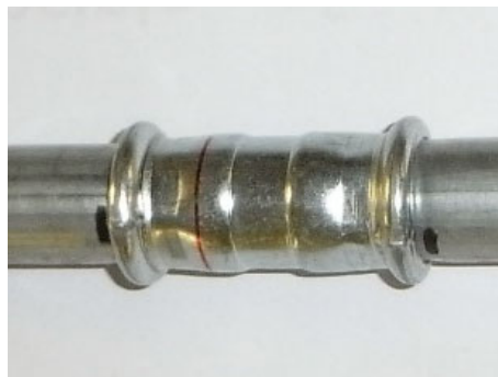
Fig. 3 Pressed Fitting