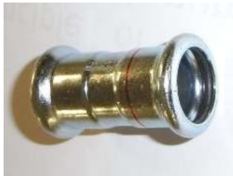
Fig. 1 Fitting before installation (EPDM)